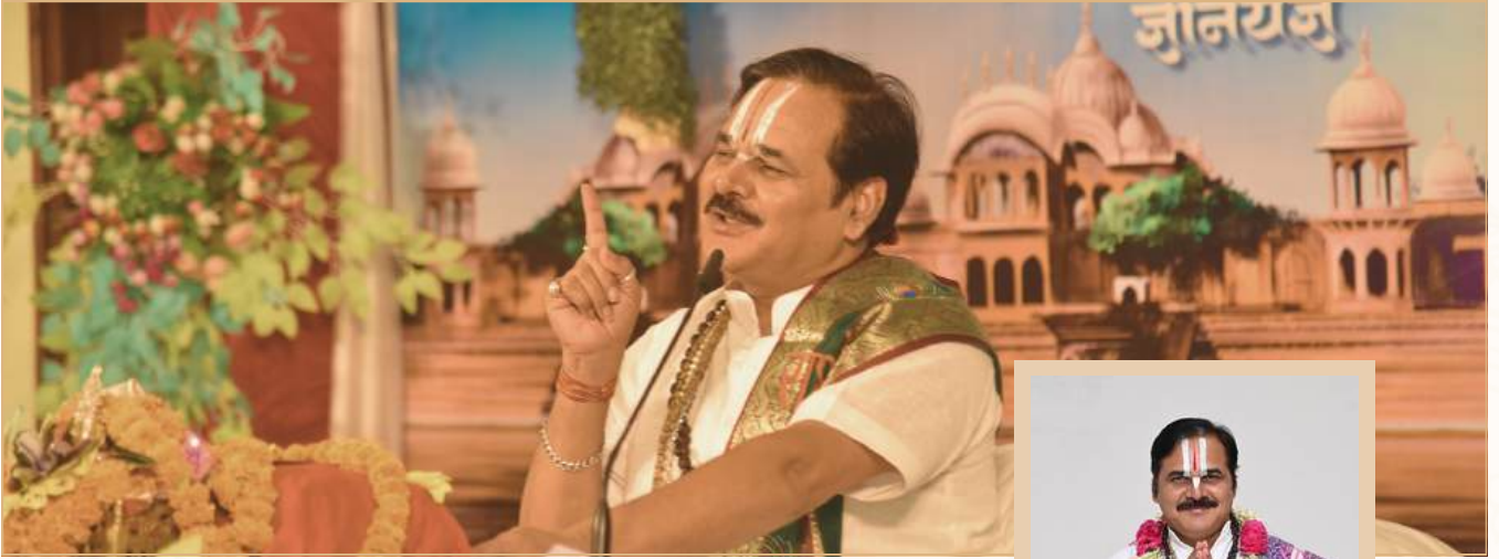
Our creative team